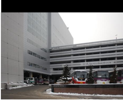
● ① Wonju Bus Terminal (Rear)