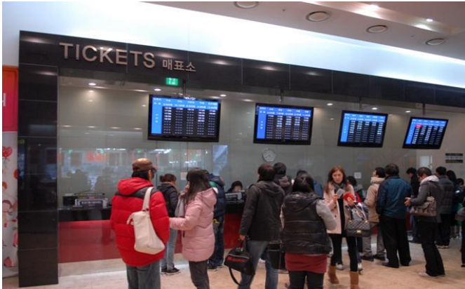
● Ticket Counter at Wonju Bus Terminal