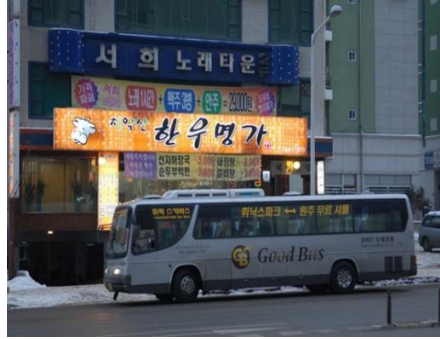
● ⑥ Shuttle Bus Stop